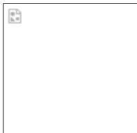
Holiday Shopping Guide 2013

Catfish Alley Magazine features the people, places, food and events we all love about the South. Visit catfishalley.com for details. READ OUR SPECIAL SECTIONS ONLINE (Publications will be opened in a new window)